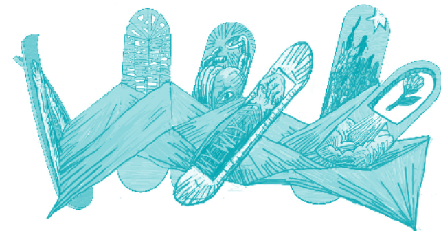
Sketch of work-in-progress by Popok Triwahyudi

Cannot Be Bo(a)rdered is a visual exploration of youth rebellion through skate culture. The exhibition will explore popular 20 th century subcultures in new works by 16 artists/collectives from Singapore, Malaysia and Indonesia. Using the skateboard as a primary medium, each work will challenge existing stereotypes by reconstructing a new narrative through different creative styles and visual expressions.