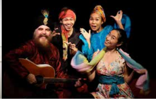
Oodles of Noodles