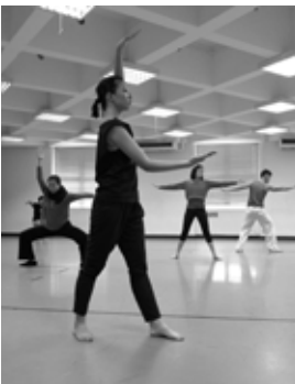
Viewpoints Experience Workshop