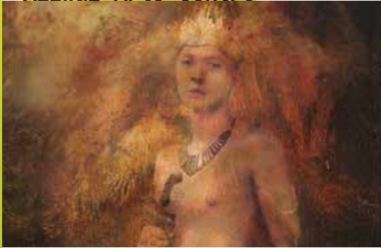
Utama: Every Name In History Is I