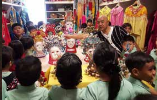
The Chinese Opera Institute