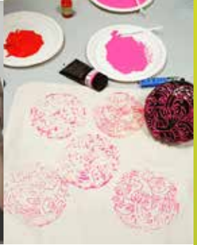
The Local People Art Market